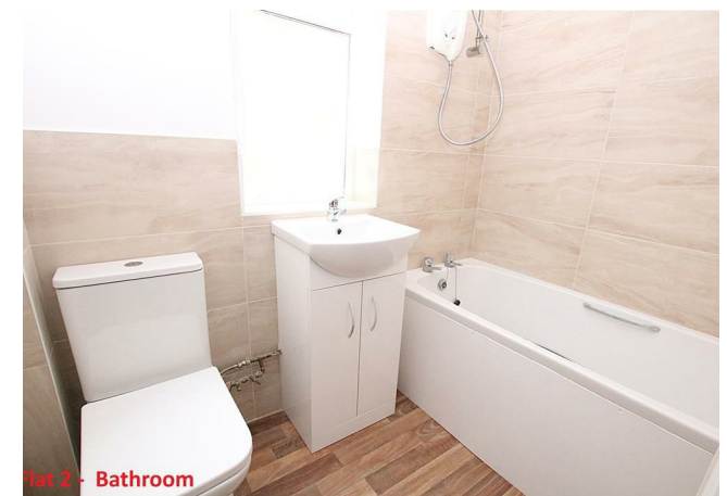
Flat 2 - Bathroom