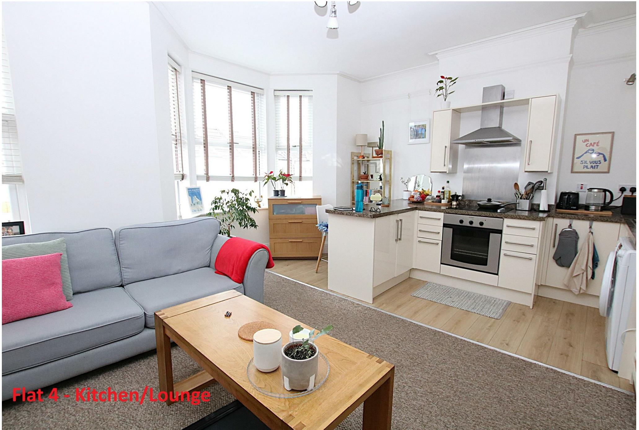
Flat 4 - Kitchen/Lounge