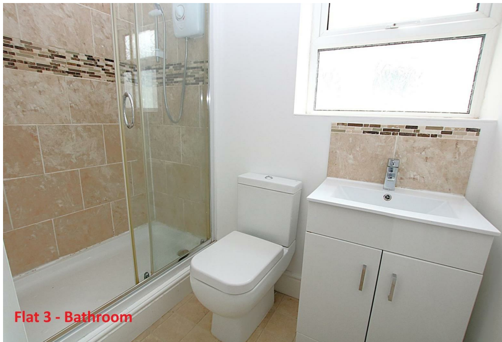
Flat 3 - Bathroom