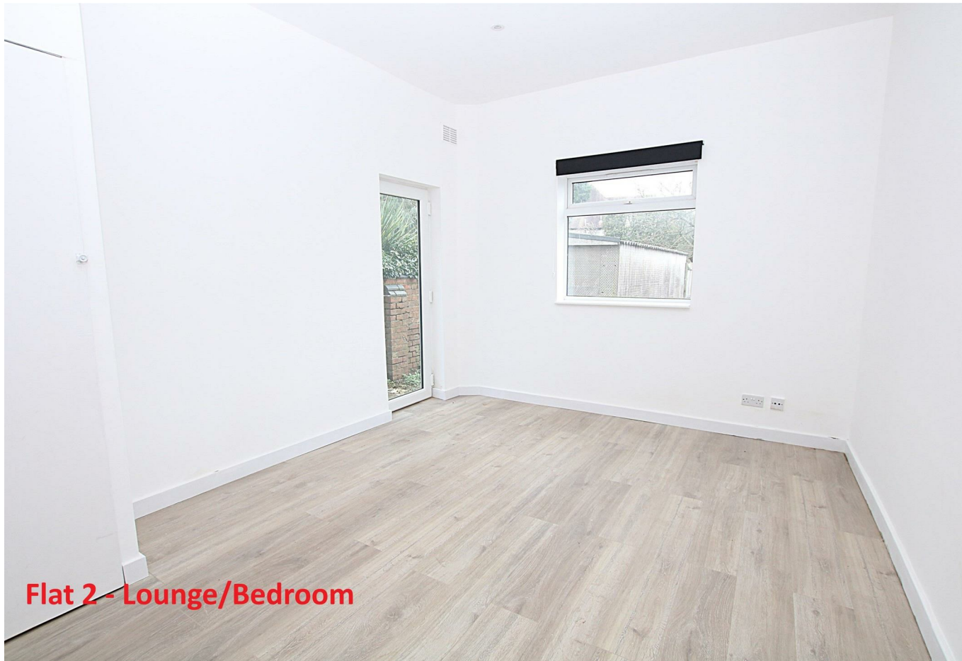
Flat 2 - Lounge/Bedroom