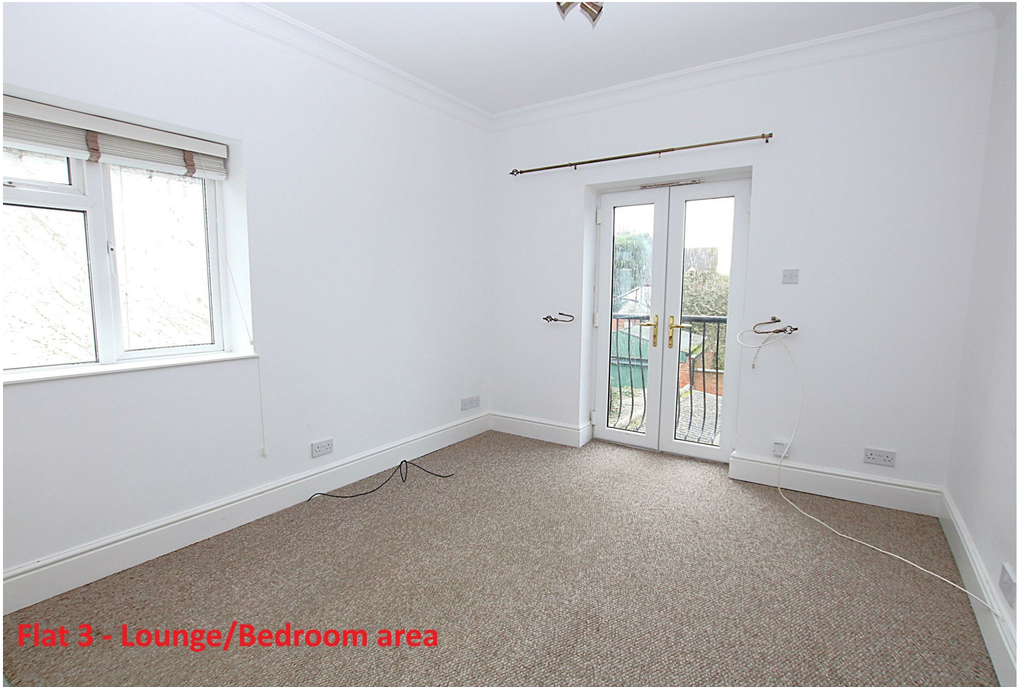
Flat 3 - Lounge/Bedroom area