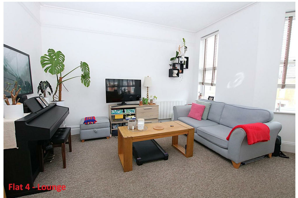
Flat 4 - Lounge