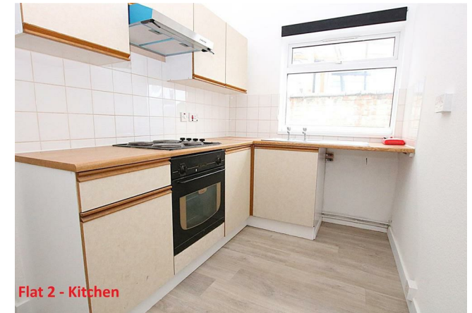
Flat 2 - Kitchen