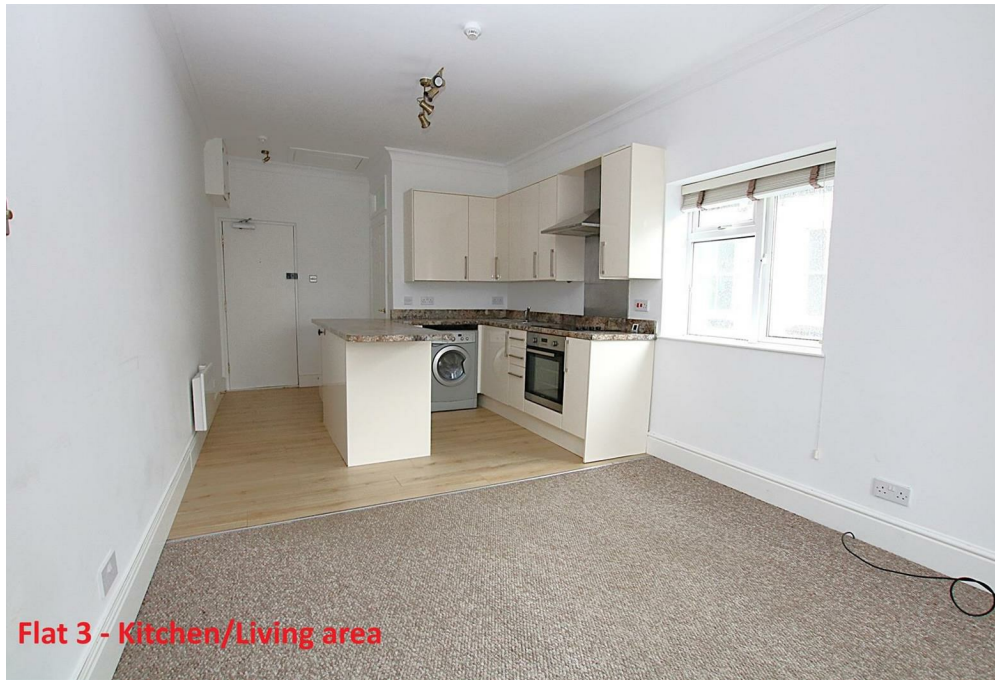
Flat 3 - Kitchen/Living area