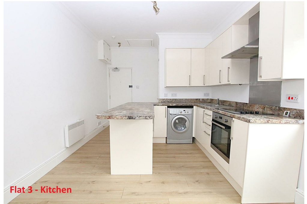
Flat 3 - Kitchen